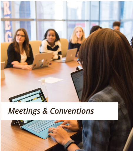
Meetings & Conventions